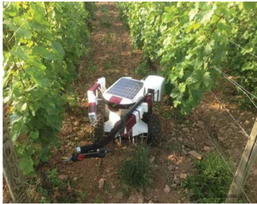
Fig.3. Robotic seeds farming