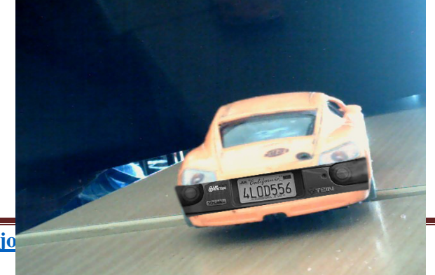
FIG. 4CAPTURED SCENE OF VIOLATED VEHICLE