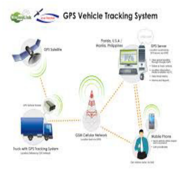
Fig1.GPS System Architecture

one will be able to access information, view vehicle data, and elicit important details from it. When a vehicle collision occurs ,dual axis accelerometer detects the level of collision and then small range accelerationsensor automatically detects the vehicle roll angle is greater than the set value given using GSM Technology to senda accident information to the owner family and rescue units.