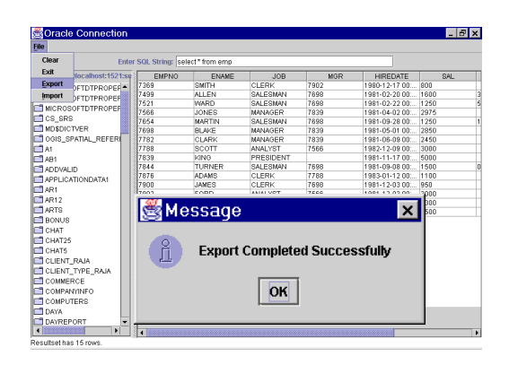
Fig5.import export data

Exports selected database – Depending on the user selected database type (based on the provider, such as Access, SQL server, and Oracle) the required routine to export will be selected and executed. This routine generally reads the data from the different tables in that database and exports it to a file of SWM own format.